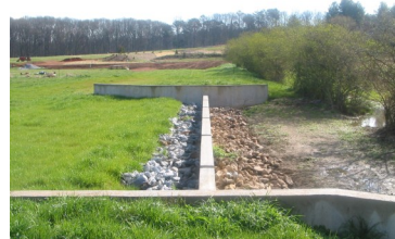
This photo is from 2004 before the boardwalk was constructed across the weir.